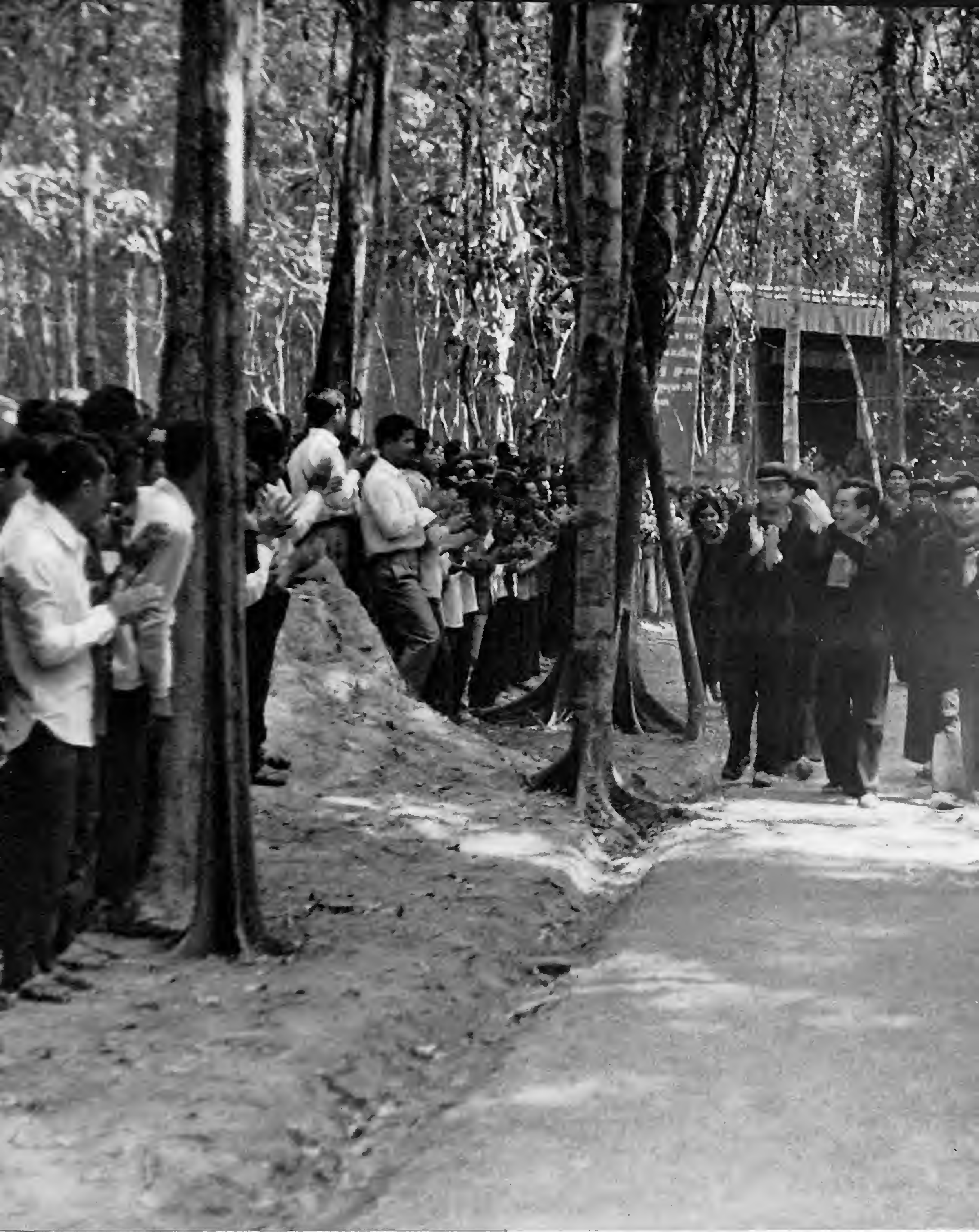
Patriotic soldiers and civilians cheering the Head of State.